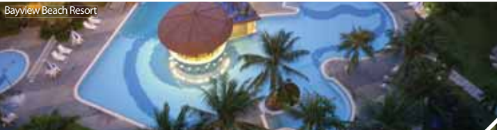
Bayview Beach Resort

7 nights from $1,039pp Superior Hillview Room with breakfast Bonus offer • Includes 3 Free nights