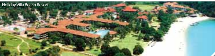
Holiday Villa Beach Resort

7 nights from $1,085pp Superior Room Bonus offer • Includes 2 Free nights