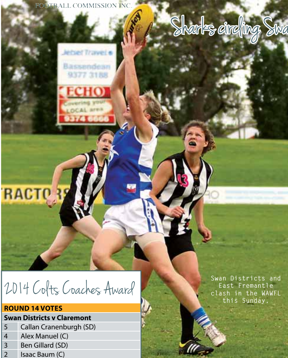
Swan Districts and East Fremantle clash in the WAWFL this Sunday.