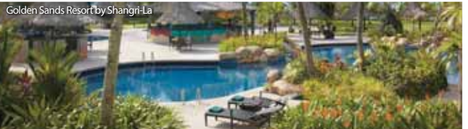
Golden Sands Resort by Shangri-La

7 nights from $1,119pp Superior Hillview with breakfast Bonus offers • Includes 3 Free nights • 20% discount on Spa treatments at CHI