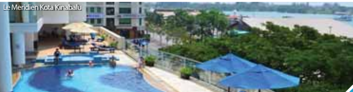
Le Meridien Kota Kinabalu

7 nights from $1,149pp Add 4 nights for an extra $370pp Classic Room with breakfast Bonus offers • Includes 1 Free night • Early check-in with breakfast on day of arrival • 1 x Free buffet dinner for 2 & bottle of house wine