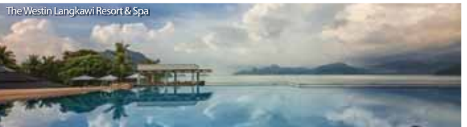
The Westin Langkawi Resort & Spa

7 nights from $1,425pp Superior Room Bonus offer • Includes 2 Free nights