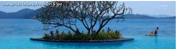
Shangri-La's Tanjung Aru Resort & Spa

7 nights from $1,276pp Add 4 nights for an extra $500pp Kinabalu Mountain View Room with breakfast Bonus offers • Includes 2 Free nights • Free upgrade to Kinabalu Seaview Room